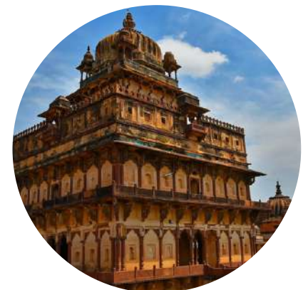
DATIA PITAMBRA PEETH