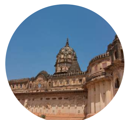
LAXMI NARAYAN TEMPLE