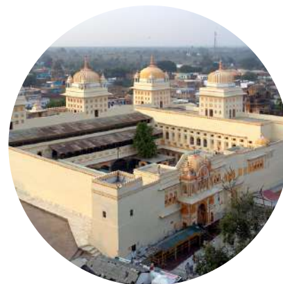
RAM RAJA TEMPLE